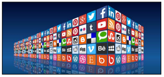
Figure 1: Social Media Platforms